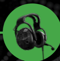
Sordin left/RIGHT CO CC