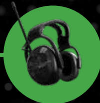
Sordin left/RIGHT FM Pro

The battery time is generous, for example appr. 300 hours for the CO Pro and CO CC models. Even so, we equipped all electronic models (except CC) with a battery save function, which automatically turns off the hearing protector after four hours of idle time. So, you can trust the batteries to be ok even if you'd leave your Sordin left/RIGHT on by accident over night.