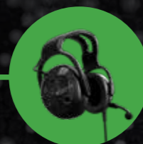
Sordin left/RIGHT CO CC