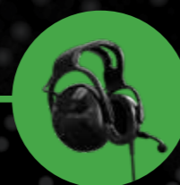
Sordin left/RIGHT CC