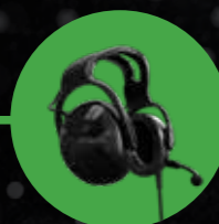
Sordin left/RIGHT CC

"CC" in models CC and CO CC stands for "connected by cable", which means that you must connect an external communication device to the built-in cable of your Sordin left/RIGHT unit.