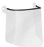
WVI00024 PLASMA FACE SHIELD